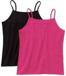
Cami (unless as an undershirt)