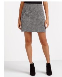
Skirts above the knee