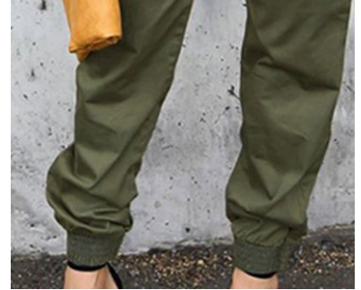
Pants gathered at the bottom